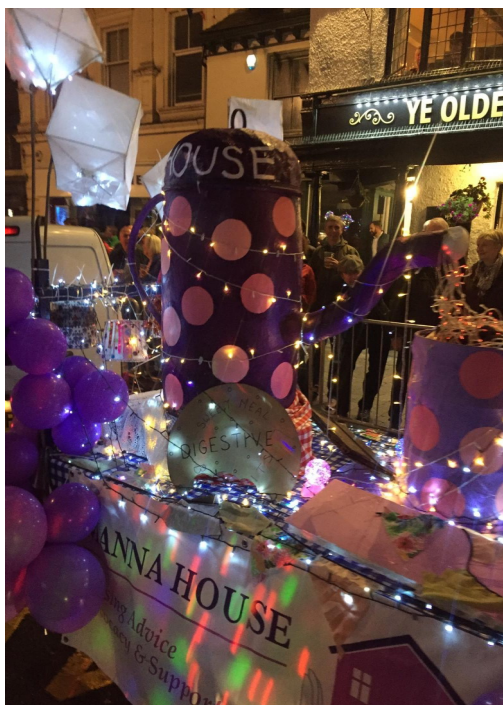
The Winning Manna House Float